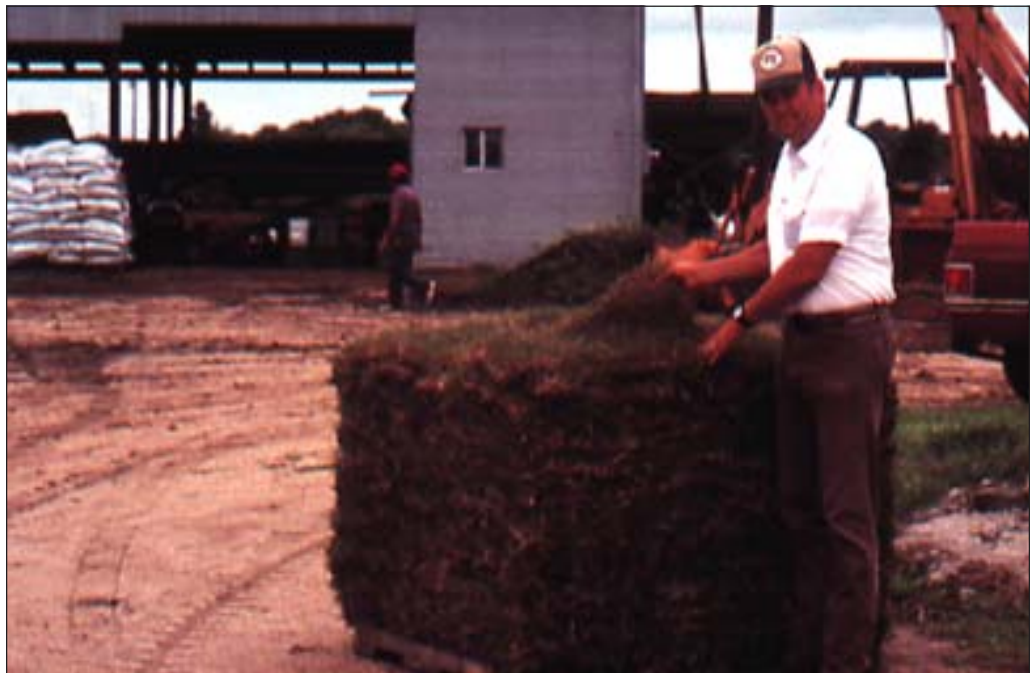
Figure 7 —Grass sod can be infested with newly mated queens as well as entire fire ant colonies.

Procedure —Apply a single broadcast application of chlorpyrifos with ground equipment (fig. 7) or apply two sequential broadcast applications of granular fipronil. Immediately after treatment, apply at least 1.5 inches of water to treated areas.