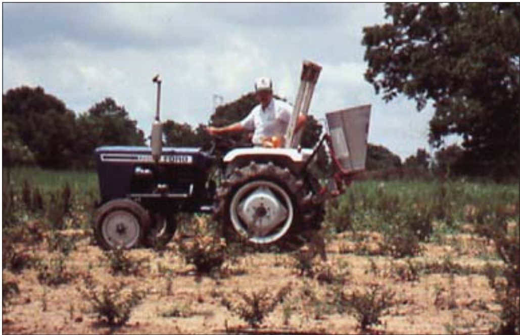
Figure 4 —Field-grown nursery stock can be certified for shipment based on in-field treatments with baits used in combination with granular chlorpyrifos.

Certification Period —12 weeks; an additional 12 weeks of certification can be obtained with a second application of granular chlorpyrifos.