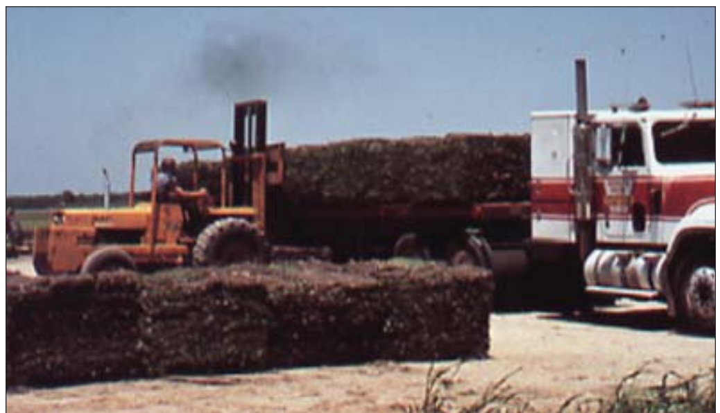
Figure 2 —Sod is frequently shipped from turfgrass farms inside the IFA quarantine area to places where fire ants have not yet become established. Regular field monitoring and a close look at each outgoing shipment can help reduce the likelihood of spreading fire ants to new areas.

Certificates authorizing movement of regulated articles are issued by quarantine officials when certain approved procedures have been utilized to ensure that the regulated article(s) are free from imported fire ant infestation. See page 19 for a complete listing of State regulatory officials and U.S. Department of Agriculture (USDA) State Plant Health Directors.