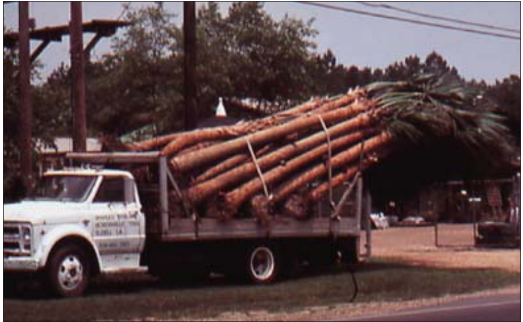
Figure 6 —The new owners of these large palm trees can be confident that they were shipped from an IFA-free nursery.

2. Control —Nursery plants that are shipped under this program must originate in a nursery free of the IFA (fig. 6). Nursery owners must implement a treatment program with registered bait and contact insecticides. The premises, including growing and holding areas, must be maintained free of the IFA. As part of this treatment program, all exposed soil surfaces (including sod and mulched areas) on property where plants are grown, potted, stored, handled, loaded, unloaded, or sold must be treated with a broadcast application of bait at least once every 6 months. The first application is more effective when applied early in the spring. An early spring bait application provides control before winged queens are produced or have time to establish new colonies. Follow label directions for use.