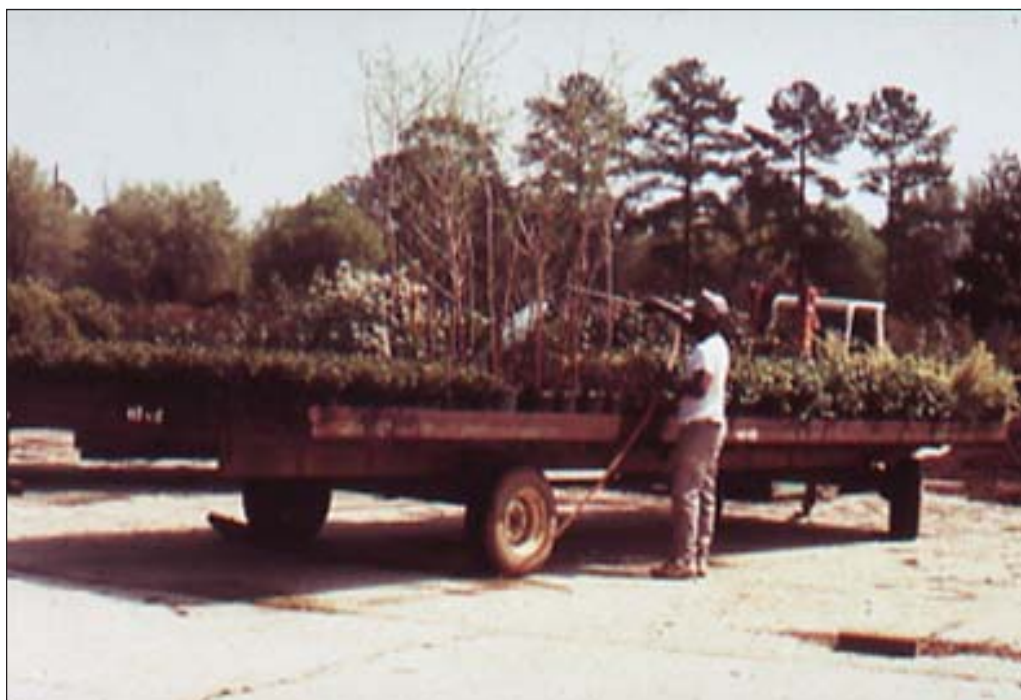
Figure 3 —This nursery worker is drenching containerized plants.