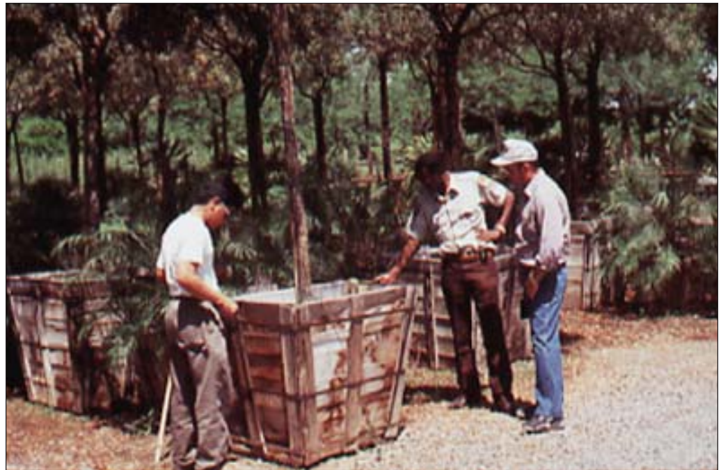
Figure 5 —State plant regulatory officials inspect nursery stock and enforce the Federal IFA quarantine.

Nurseries participating in this program will also be inspected by Federal or State inspectors at least twice a year. More frequent inspections may be necessary depending upon IFA infestation levels immediately surrounding the nursery, the management's thoroughness in maintaining the premises, and the number of previous detections of IFA's in or near containerized plants. Inspections by Federal and State inspectors should be more frequent just before and during the peak shipping season. Any nursery determined to have IFA colonies must be immediately treated to the extent necessary to eliminate all detectable colonies.