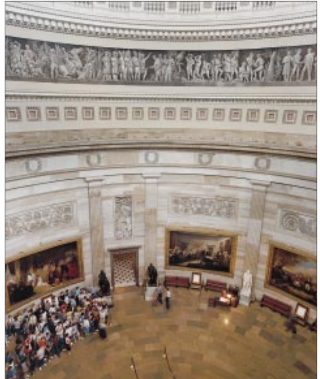
The Rotunda is a highlight of a visit to the Capitol.

Visitors are encouraged to tour the Capitol, view its artwork and historic rooms, spend time in the galleries, and visit the offices of their senators and representatives. Congress is proud to maintain the Capitol as a building with few restrictions on visitors. The Capitol is open seven days a week, except Thanksgiving, Christmas, and New Year’s Day. For information on hours and tours call (202) 225-6827. When the Senate and House are in session, passes are necessary for admission to the chamber galleries. Visitors may obtain passes from their representative or senators. Foreign visitors may obtain House passes at the House appointment desk on the first floor and Senate passes at the Senate appointment desk, also on the first floor. Tours and assistance for persons with disabilities are available from the Congressional Special Services Office, in