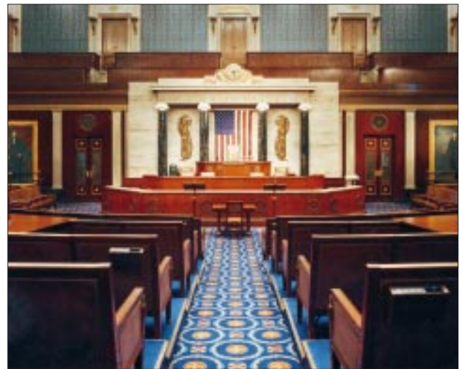
The chamber of the House of Representatives.

The House of Representatives, under a law passed in 1911, is limited to 435 members. States are assigned a number of representatives based on their population and are redistricted every ten years after the census. Each state is entitled to at