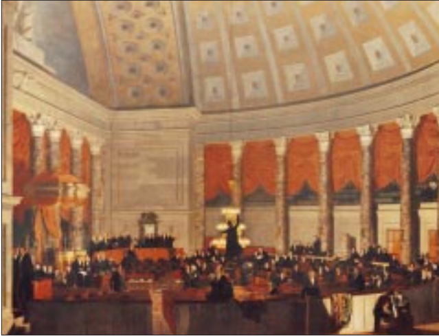
The Old Hall of the House of Representatives, as painted by Samuel F.B. Morse, in the collection of The Corcoran Gallery of Art.

moved into the small, cramped north wing. At first, the House met in a large room on the second floor intended for the Library of Congress; the Senate met in a chamber on the ground floor. Between 1810 and 1859, the Senate used a chamber on the second floor, now known as the Old Senate Chamber.