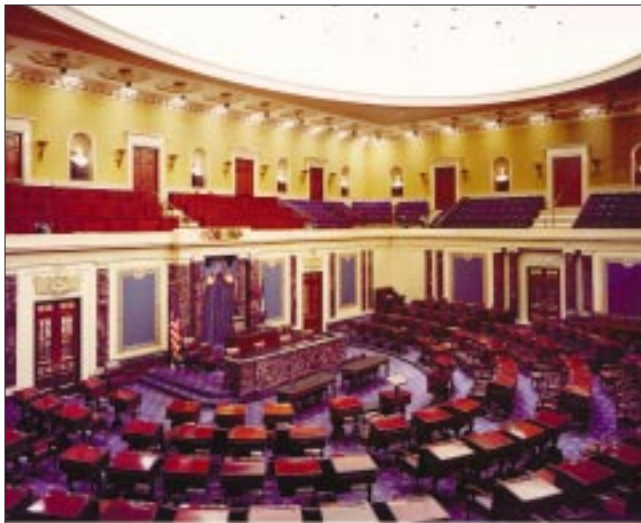
The Senate chamber.

The Senate has 100 members, two from each state. A senator must be thirty years of age, a resident of the state, and a citizen of the United States for nine