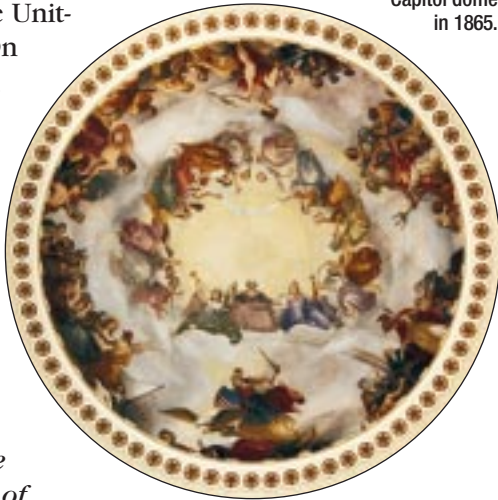
Constantino Brumidi painted The Apotheosis of Washington inside the Capitol dome in 1865.

Help preserve the Capitol's art treasures for future generations. Please look at and enjoy, but do not touch , the paintings and sculptures.