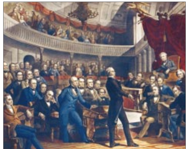
Senator Henry Clay speaks on behalf of the Compromise of 1850 in the Old Senate Chamber.

The original Capitol was designed by Dr. William Thornton, and the cornerstone was laid by President George Washington on September 18, 1793. Benjamin Henry Latrobe and Charles Bulfinch, among other architects, directed its early construction. In 1800, when the government moved from temporary quarters in Philadelphia to Washington, DC, the Capitol that awaited them was an unfinished brick and sandstone building. The Congress