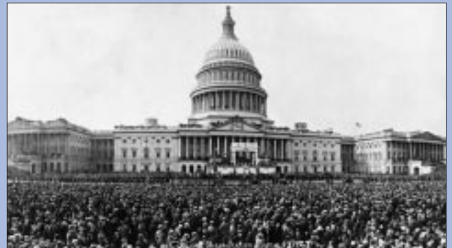
Presidential Inaugurations have taken place at the Capitol since 1801. Seen here is Calvin Coolidge's Inauguration in 1925 (below).