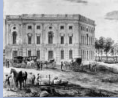
A view of the Capitol in 1800 with only the north wing completed (left).