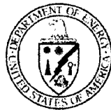
SAMUEL W. BODMAN Secretary of Energy