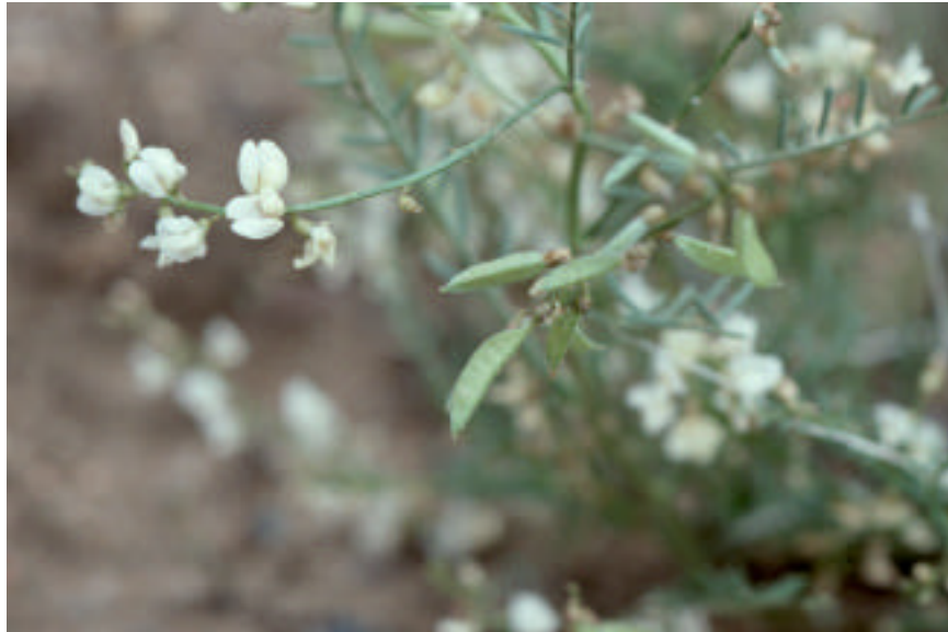
Closeup of Astragalus mulfordiae