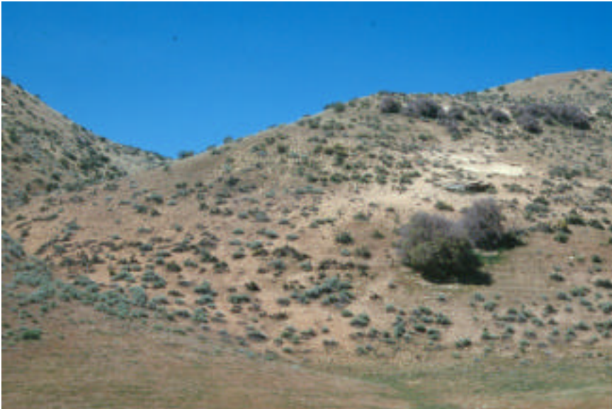
Habitat of Astragalus mulfordiae