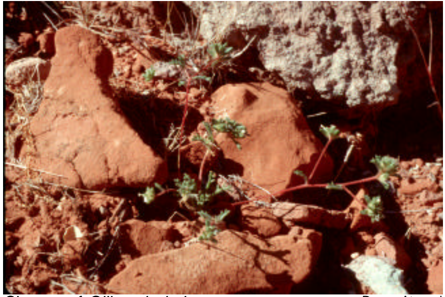
Closeup of Gilia polycladon