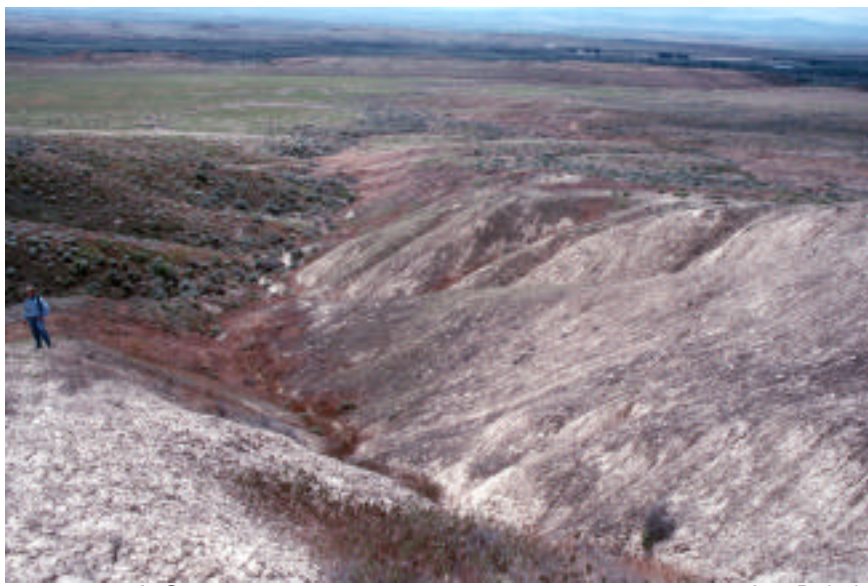
Habitat of Gilia polycladon