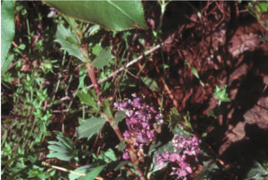
Closeup of Ceanothus prostratus