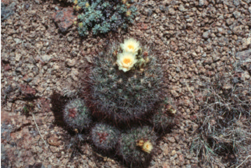
Closeup of Pediocactus simpsonii var. robustior