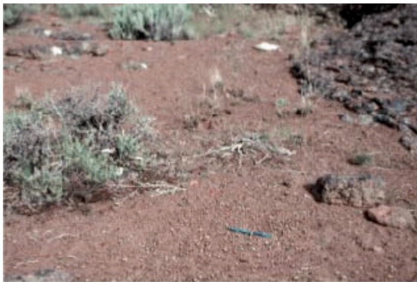
Habitat of Dimeresia howellii