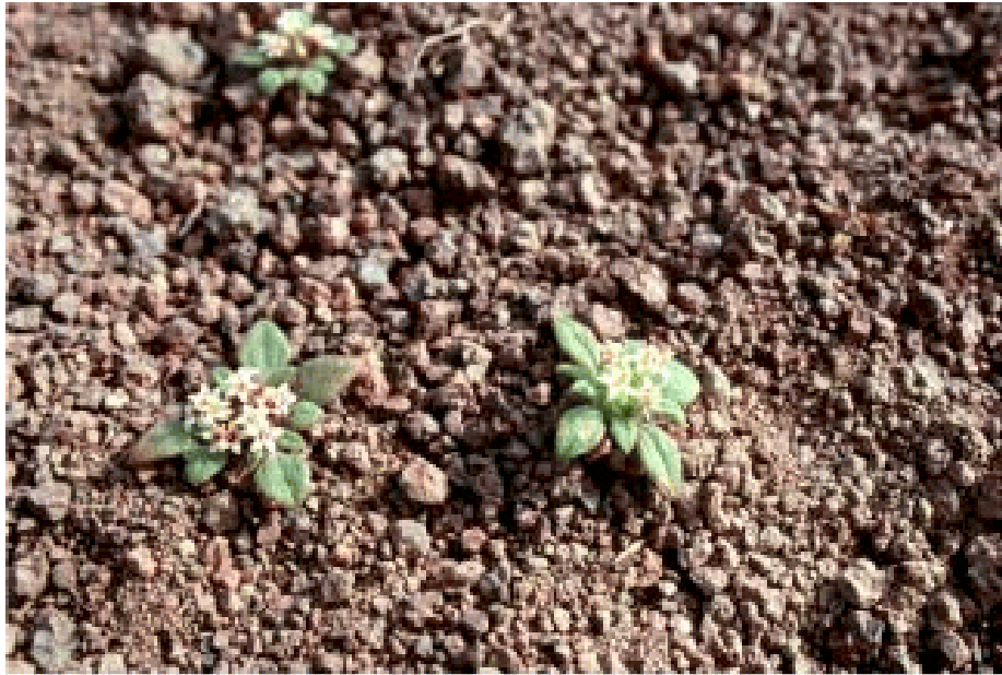
Closeup of Dimeresia howellii