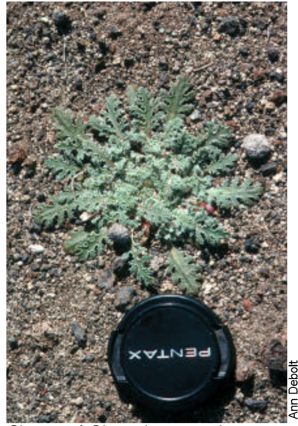
Closeup of Glyptopleura marginata