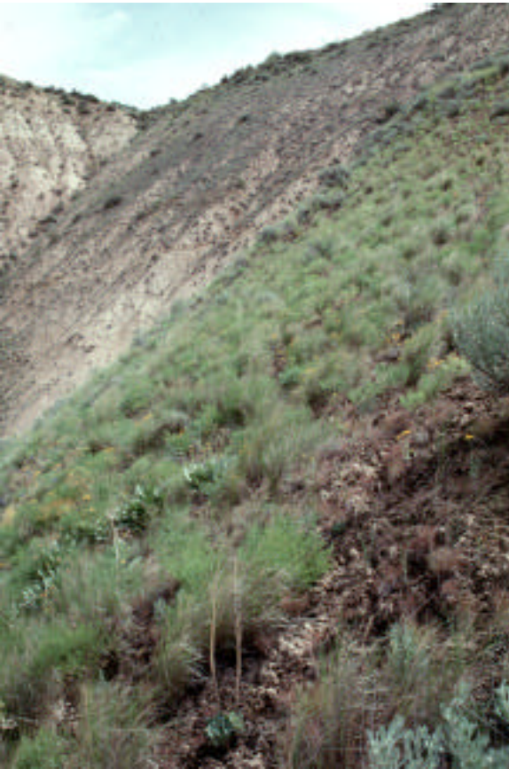
Habitat of Astragalus cusickii var. packardiae