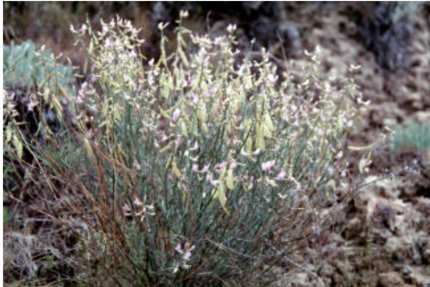
Closeup of Astragalus cusickii var. packardiae