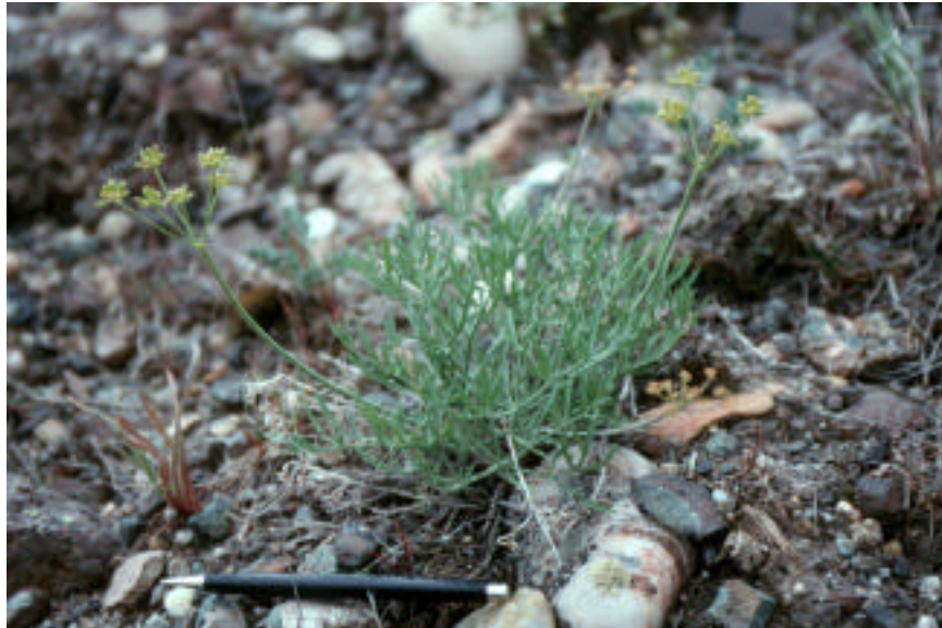
Closeup of Lomatium packardiae