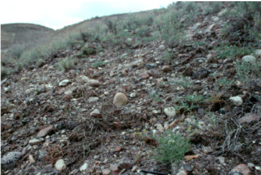
Habitat of Lomatium packardiae