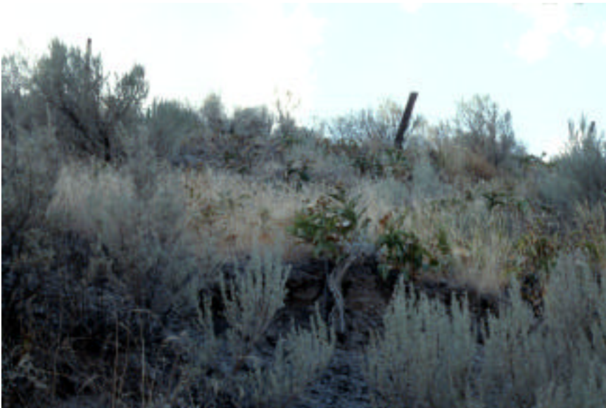
Habitat of Haplopappus radiatus