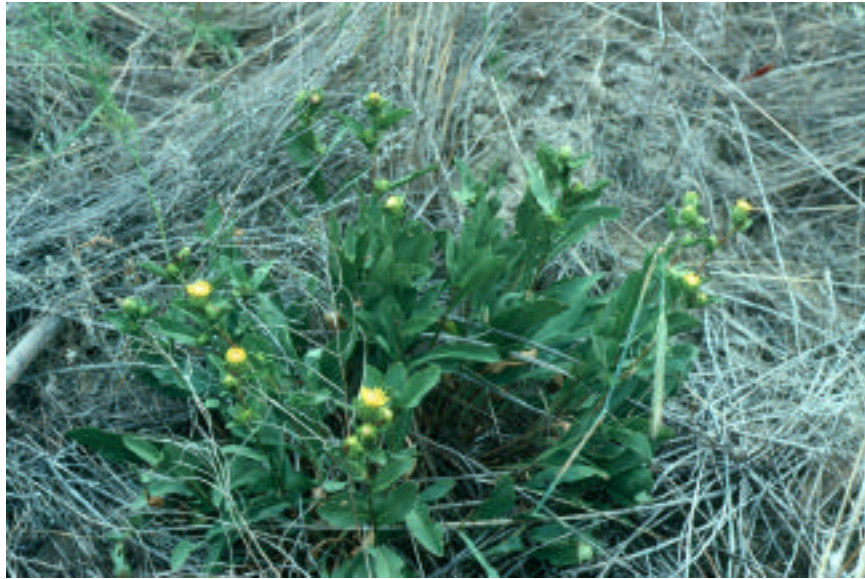
Closeup of Haplopappus radiatus