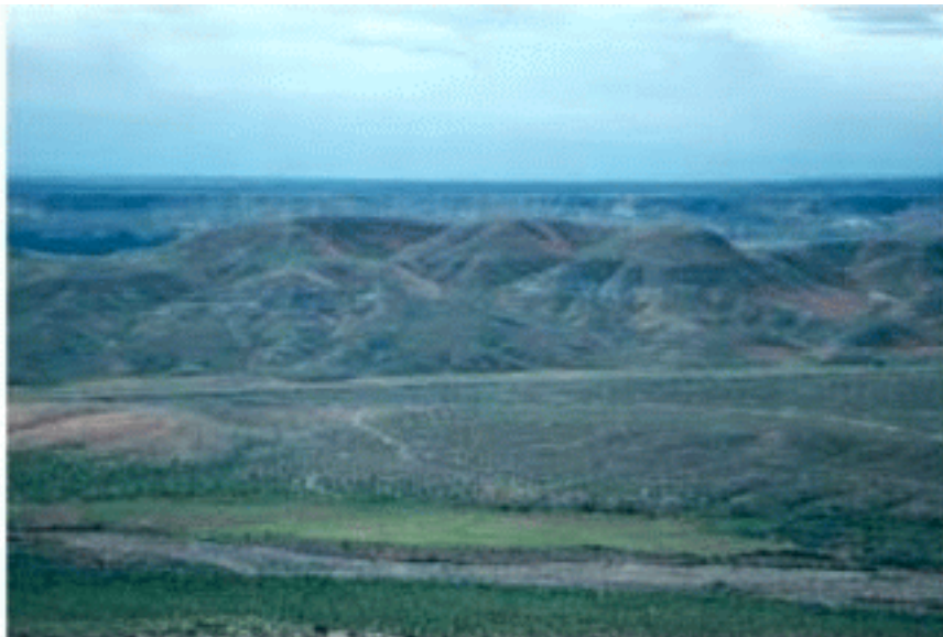
Habitat of Blepharidachne kirgii