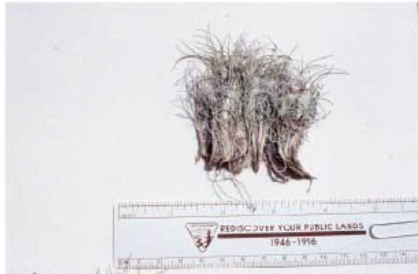
Closeup of Blepharidachne kirgii