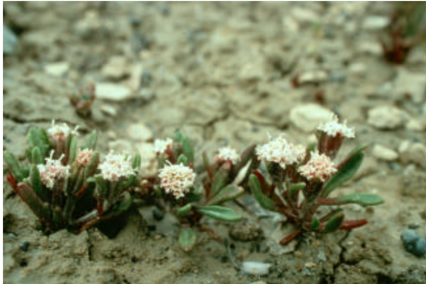
Closeup of Chaenactis cusickii