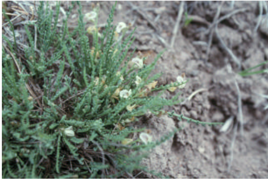
Closeup of Astragalus yoder-williamsii