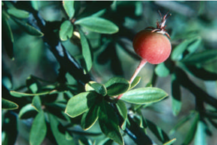
Closeup of Peraphyllum ramosissimum