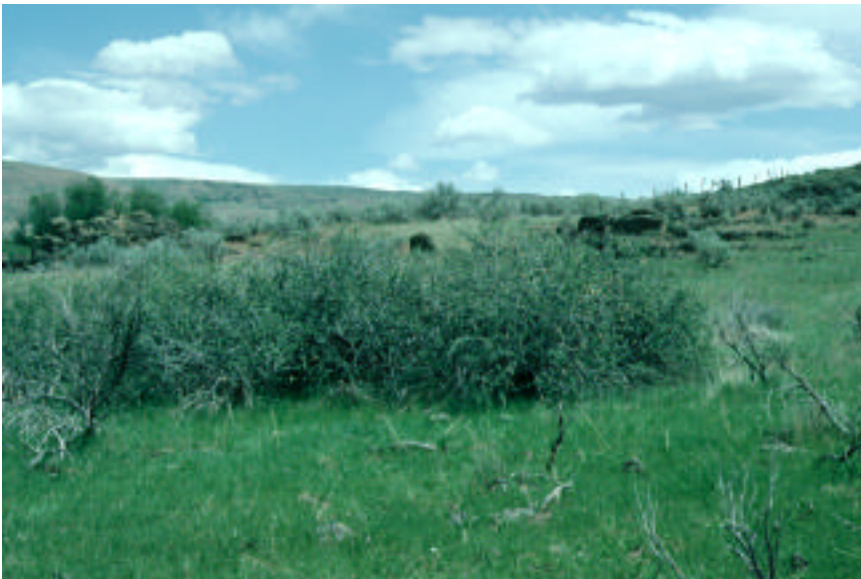
Habitat of Peraphyllum ramosissimum