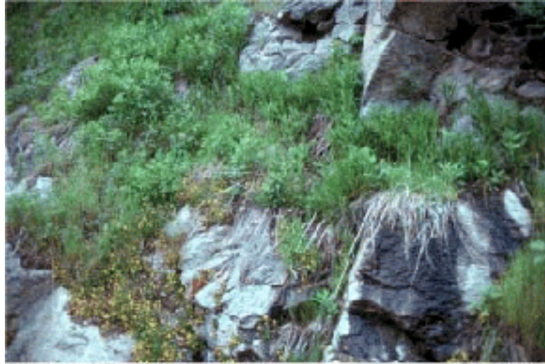
Habitat of Epipactis gigantea