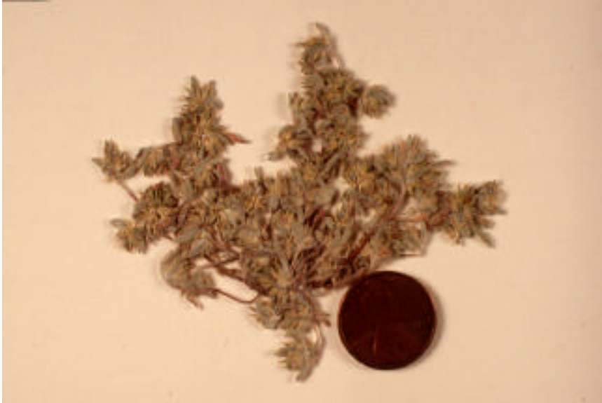
Closeup of Stylocline filaginea