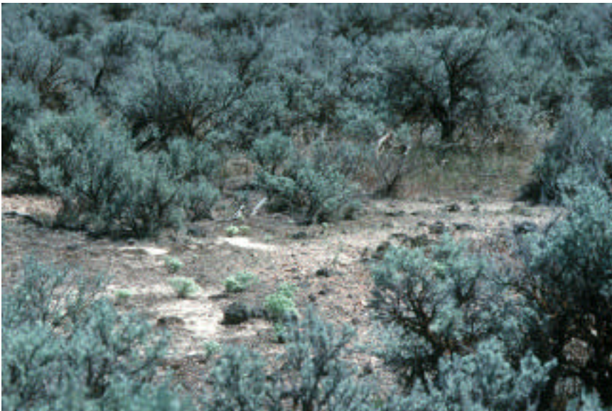
Habitat of Lepidium papilliferum