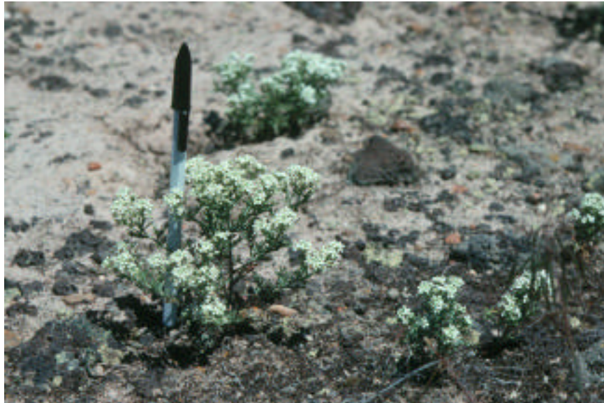
Closeup of Lepidium papilliferum