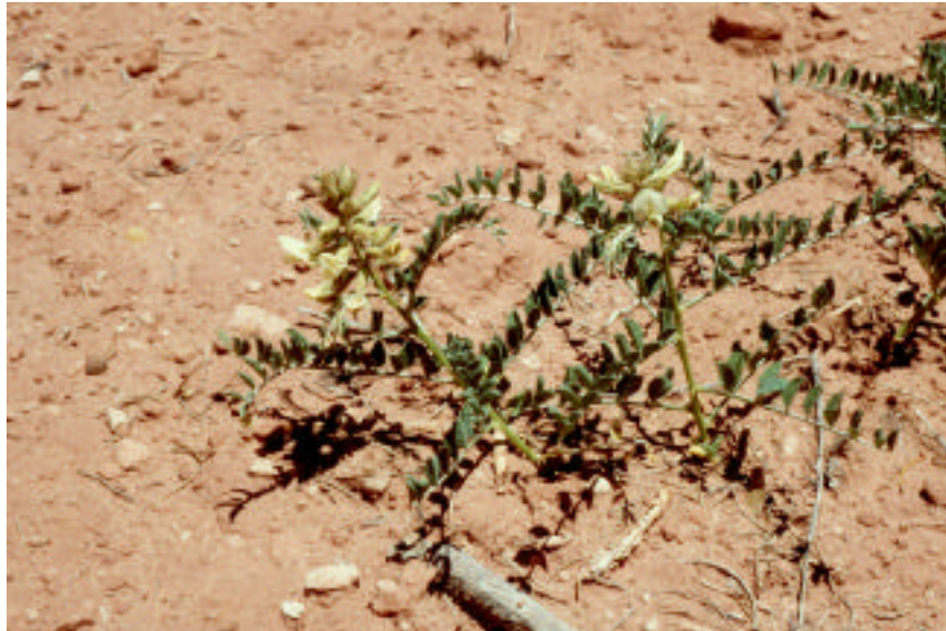
Closeup of Peteria thompsoniae