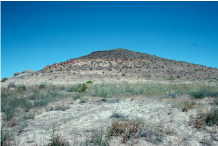
Habitat of Peteria thompsoniae