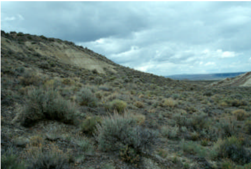
Habitat of Penstemon janishiae