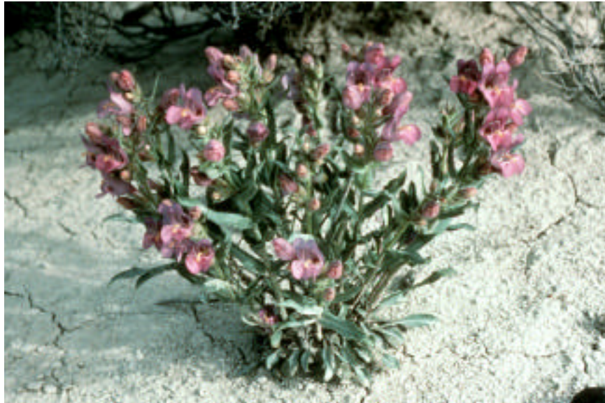
Closeup of Penstemon janishiae