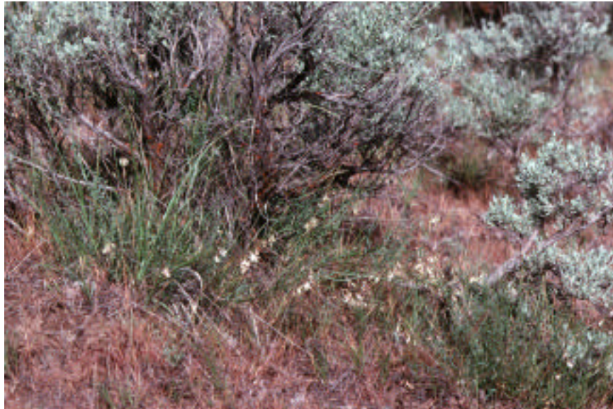
Closeup of Astragalus atratus var. inseptus