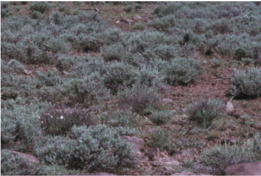
Habitat of Astragalus atratus var. inseptus