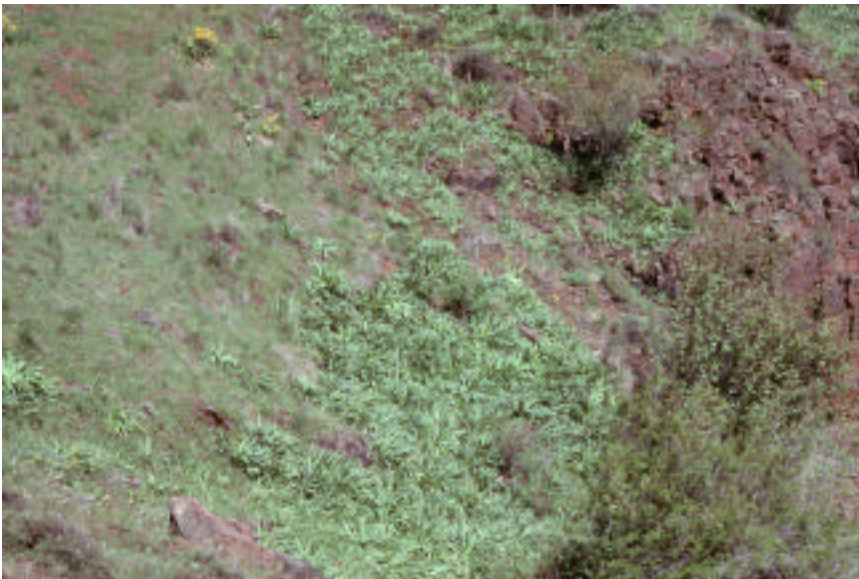
Habitat of Camassia cusickii