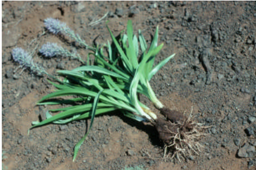
Closeup of Camassia cusickii