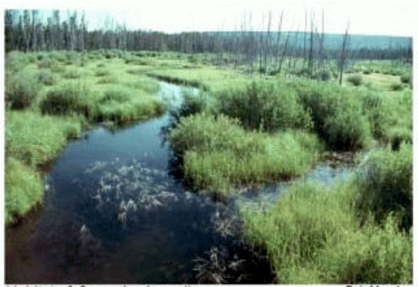
Habitat of Carex buxbaumii