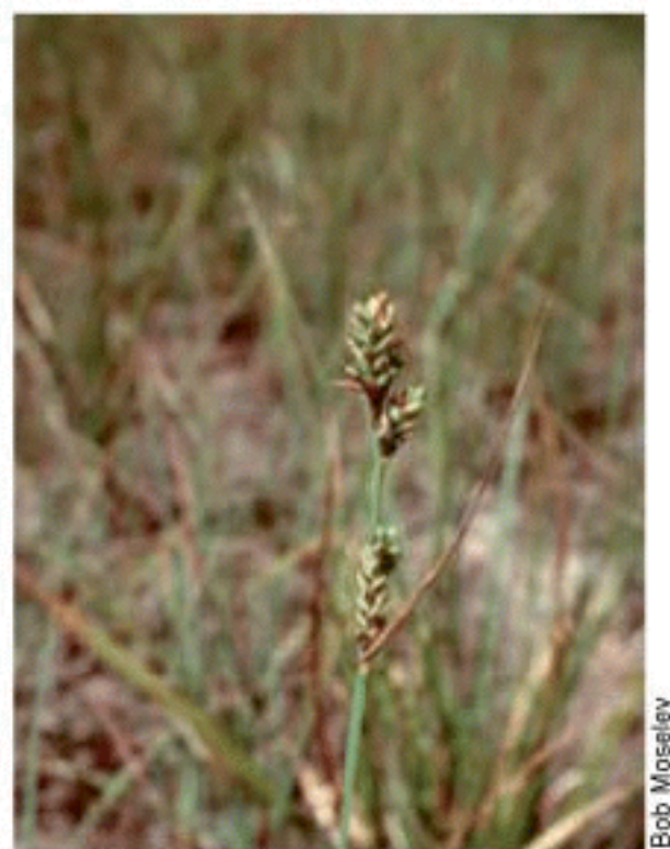
Close up of Carex buxbaumii