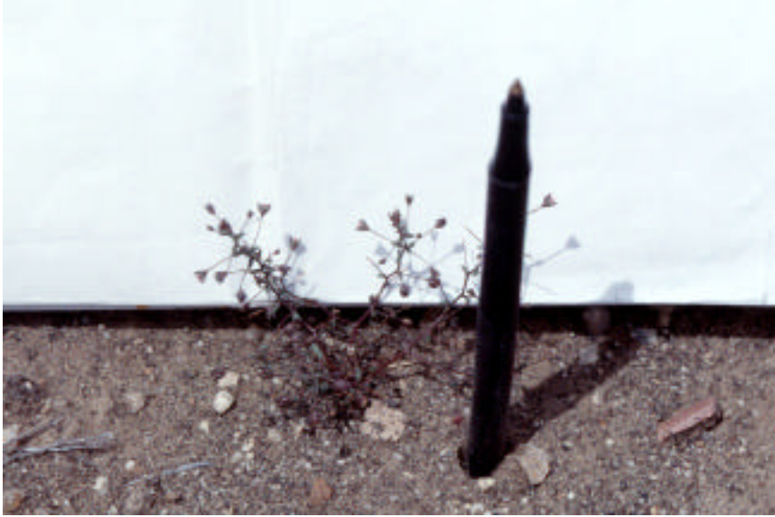
Closeup of Nemacladus rigidus