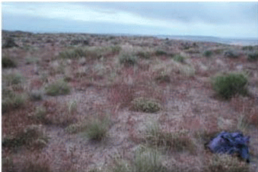
Habitat of Astragalus purshii var. ophiogenes