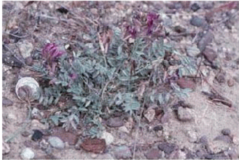
Closeup of Astragalus purshii var. ophiogenes