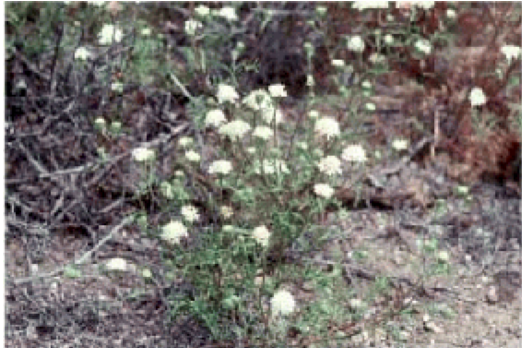
Closeup of Chaenactis stevioides