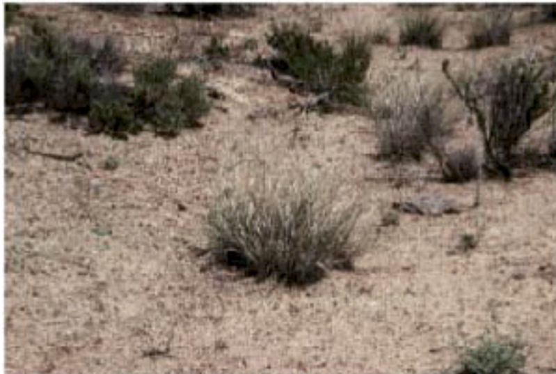
Habitat of Chaenactis stevioides