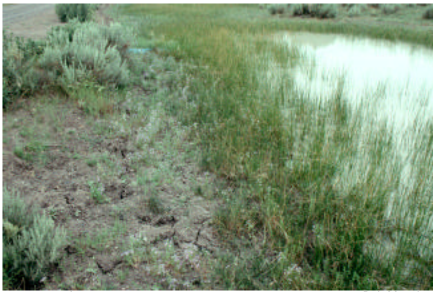
Habitat of Downingia bacigalupii