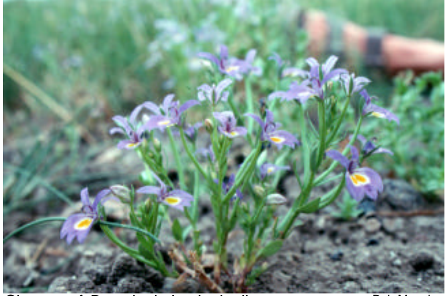
Closeup of Downingia bacigalupii