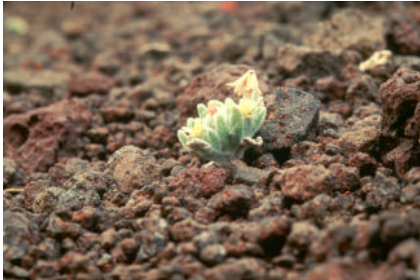
Closeup of Eatonella nivea