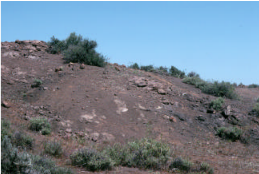
Habitat of Eatonella nivea