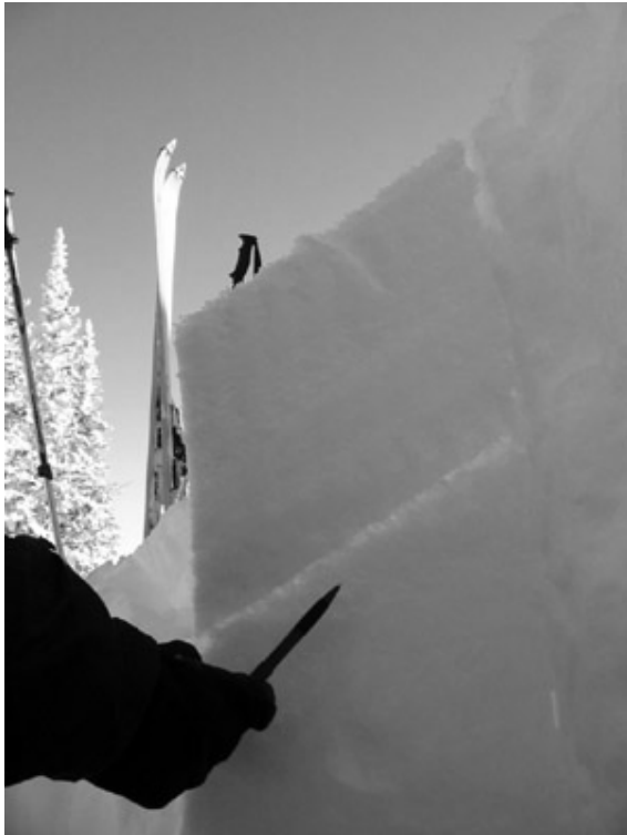
Figure 2: Backlit photograph of the surface hoar layer tested in this study, with a hand holding a pencil for scale. Photo taken on 1/1/02 approximately 200 m uphill from where the plots were sampled.

weeks. Within each plot we used a systematic sampling design, distributing five snowpits in a regular pattern across the plot (for a diagram of the pit layout, see Landry et al. , 2001). Shear strength data for our targeted surface hoar layer was collected using the quantified loaded column stability test (QLCT) method (Landry et al. , 2001). Ten QLCT were performed in each of the five snowpits, using two rows of five, 50 cm