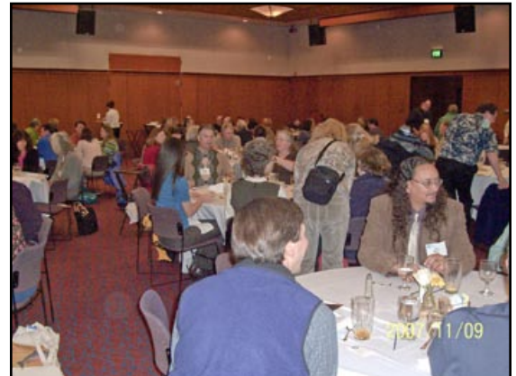
Attendees at conference banquet.

This year's biennial Regional Research and Extension Water Quality Conference was held in early November 2007 at the Skamania Lodge in Stevenson, WA. The conference explored ways of merging water science and policy to promote interactive collaboration on complex water-policy decisions—an important goal for all environmental and water resources professionals in the Pacific Northwest. Our two-day conference included a unique mix of presentations, featured speakers, panel discussions, networking opportunities, and a poster session packed with information relating to a broad array of interesting regional topics presented by water organizations, policy makers, scientists, and researchers with Pacific Northwest experience. Because of the interesting and timely agenda; there were over 240 registrants in attendance. Based on feedback provided on the evaluation forms, the conference was an enormous success!