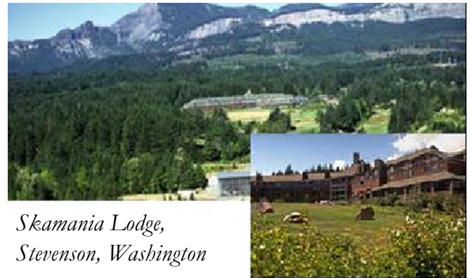
Skamania Lodge, Stevenson, Washington

The Pacific Northwest Water Quality Team is proud to announce that its fourth conference on regional water resources issues will be held this fall at the Skamania Lodge in Stevenson, Washington on November 7-9, 2007. This regional conference merges water science and policy to promote collaboration between scientists and policy makers on water-policy decisions. It was developed in response to comments from previous water quality and groundwater conference participants who stressed the need to better integrate science and policy. The conference will include presentations, featured speakers, panel discussions, and a poster session. More information will be available soon on our Web site at http://www.swwrc.wsu.edu or call 509-335-3530.