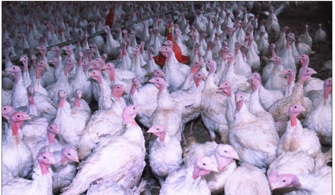
Manure and wood chips used for turkey bedding are composted and used for fertilizer on adjacent pastures.

Most of the arsenic used as an antibiotic in commercial broiler production ends up in the litter. Using this litter as a soil amendment is not prohibited by the National Organic Program, but 7CFR §205.203(c) of the Rule requires that “the producer must manage plant and animal materials to maintain or improve soil organic matter content in a manner that does not contribute to contamination of crops, soil, or water by plant nutrients, pathogenic organisms, heavy metals, or residues of prohibited substances.” Poultry litter applied at agronomic levels, using good soil conservation practices, generally will not raise arsenic concentrations sufficiently over background levels to pose environmental or human health risks. However, recent studies show that more than 70% of the arsenic in uncovered piles of poultry litter can be dissolved by rainfall and potentially leach into lakes or streams. Thus, organic producers must take care when they handle and apply poultry litter.