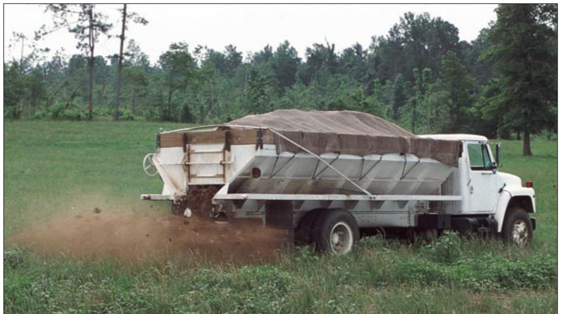
Proper waste management on the farm is essential for environmental protection.

F or information about your local soil geology and mineralogy, contact your county offices of the Natural Resources Conservation Service, Soil and Water Conservation, or Cooperative Extension.