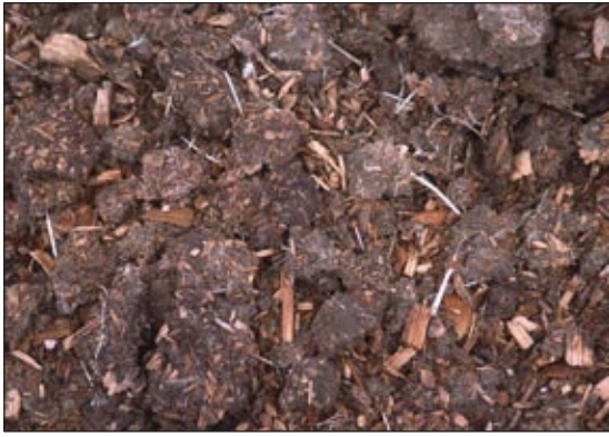
Compost containing turkey manure and wood chips from bedding material is dried and then applied to pastures for fertilizer.

arsenic but also its availability and toxicity, since the organic matter displaced arsenite more readily than arsenate.(20) In another study, kaolinite clay coated with humic acid absorbed more arsenic than did pure kaolinite clay.(21) These results seem to indicate that organic matter will enhance arsenic sorption in temperate soils but will increase arsenic solubility in highly weathered soils.