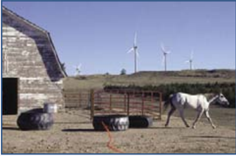
The Municipal Energy Agency of Nebraska (MEAN) owns and purchases the power from this new 10.5-MW project near Kimball.

On a summer day in Nebraska in 2003, 109 people participated in an 8-hour special survey that yielded startling results. More than 60% of the survey participants traveled more than 100 miles to voice their opinions on electricity-generating options to the Nebraska Public Power District (NPPD).