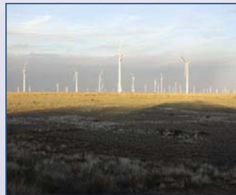
The Colorado Green Wind Farm won a solicitation bid to Xcel Energy, proving that wind energy can provide the most economical energy generation.

In April of 2003, the American Corn Growers Foundation commissioned a nationwide, random, and scientific survey of 500+ corn farmers in the 14 states representing nearly 90% of the nation’s corn production. The poll found that 93.3% of the nation’s corn producers support wind energy; 88.8% want farmers, industry, and public institutions to promote wind power as an alternative energy source; and 87.5% want utility companies to accept electricity from wind turbines in their power mix.