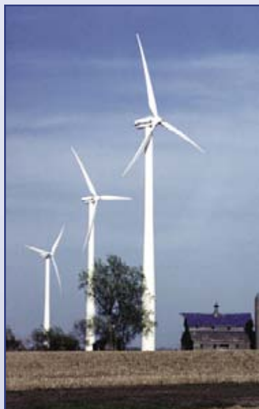
Rural communities in Nobles County, Minnesota, plan to sell their excess wind energy.