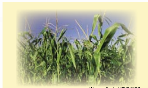
Warren Gretz / PIX04082

Wind power has the potential to displace substantial amounts of natural gas consumption, thus reducing upward pressure on natural gas demand and prices.