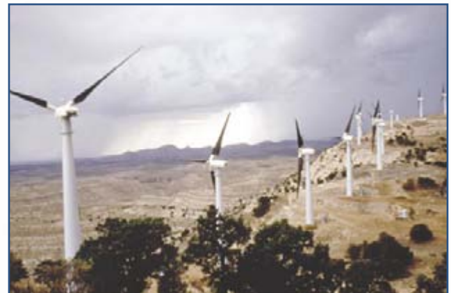
The Texas General Land Office granted permission for Texas' first commercial wind energy farm to be built on state lands in the Delaware Mountains in West Texas. This project has added more than half a million dollars to the Permanent School Fund for use in Texas schools.