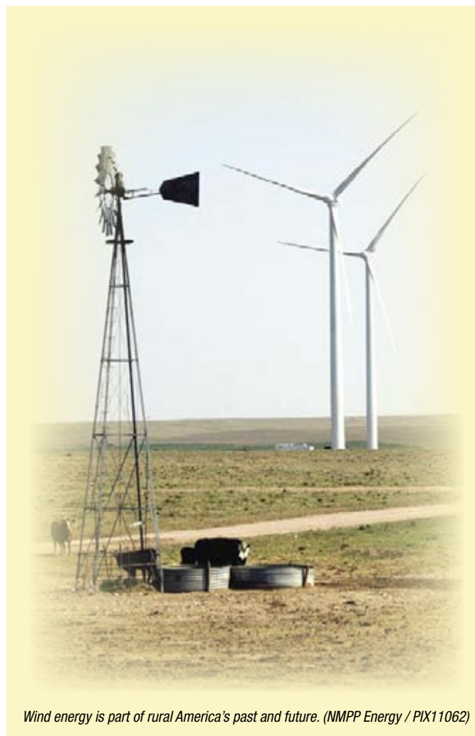
Wind energy is part of rural America’s past and future.

Although integrating wind energy into the energy portfolio mix may sound like a futuristic concept, harnessing the power of the wind is hardly a new idea. Small turbines on individual farms and ranches were commonplace before the advent of rural electrification. Wind projects in rural America may be a return to the past that could help preserve rural communities and the family farm. Making a living on the family farm has never been easy, but harnessing wind energy as the cash crop of the future is a viable way to ease the financial burdens of farmers, ranchers, and rural communities and preserve the rural way of life.