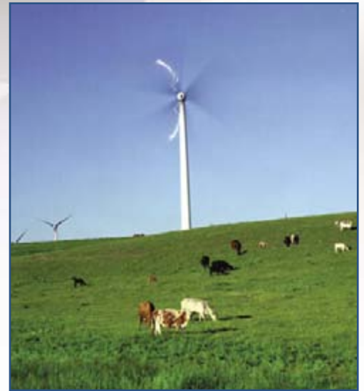
Wind turbines have a small footprint, so crops can be grown and livestock can be grazed right up to the base of the turbine.

Wind turbines have a minimal effect on farming and ranching operations. The turbines have a small footprint, so crops can be grown and livestock can be grazed right up to the base of the turbine. As Leroy Ratzlaff, a third-generation landowner and farmer in Hyde County, South Dakota, said, "It's almost like renting out my farm and still having it. And the cows don't seem to mind a bit."