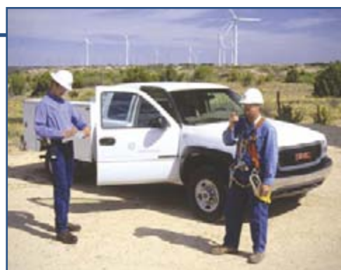
Wind energy projects create permanent operations and maintenance (O&M) jobs.

In fact, achieving the goals of the U.S. Department of Energy's Wind Powering America program during the next 20 years will create $60 billion in capital investment in rural America, provide $1.2 billion in new income for farmers and rural landowners, and create 80,000 new jobs. Wind energy is the fastest-growing energy source in the world, and your rural community may be able to reap the benefits.