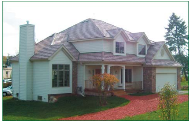
Figure 1. FPL's research demonstration house.

The basic components of rooftop rainwater harvesting are the same regardless of region: collection area, transport (gutters, pipe), first flush/filtration, storage, and distribution. However, climate plays an important