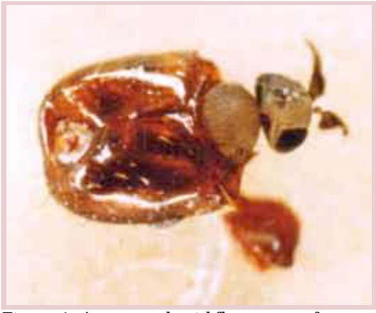
Figure 4. A young phorid fly emerges from the ant's head after pupating.