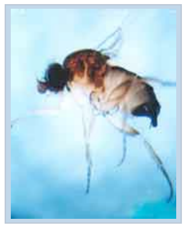
Figure 2. Phorid fly.

The small phorid flies are about 1/16 inch long and spend their time hovering above disturbed mounds or along foraging trails looking for fire ants. When a fly locates a fire ant, it swoops down and lays an egg on the ant. The egg will hatch into a tiny maggot that bores into the fire ant's head. The fly maggot grows inside the ant's head by eating the brain and other head contents. Once the ant dies the fly maggot pupates inside the head that has by now fallen off. Eventually, an adult fly emerges from the ant head and flies off to lay eggs on other fire ants.