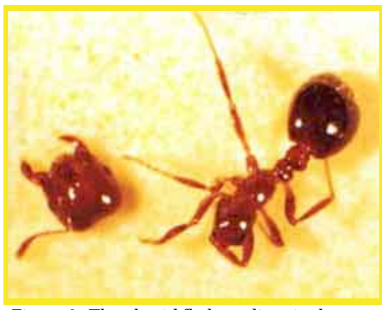
Figure 3. The phorid fly larva lives in the decapitated fire ant's head.