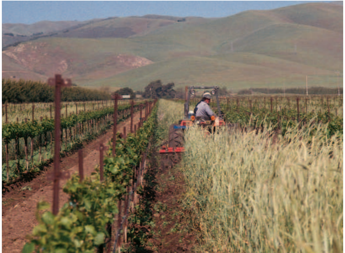
Growing rye between vineyard rows suppresses weeds — both by smothering and by producing allelopathic substances that inhibit weed germination — and attracts beneficial insects such as lady beetles to this vineyard in Monterey County, Calif.