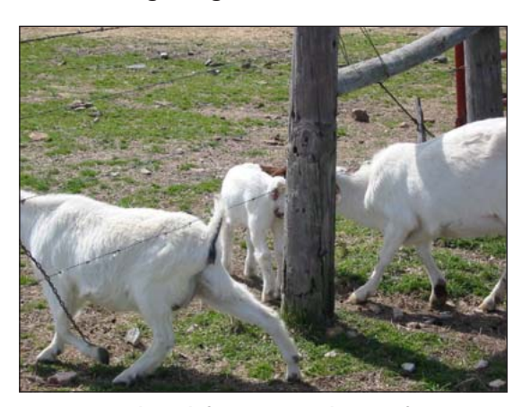
Conventional ranch fencing is inadequate for containing goats.

Woven wire fencing can have vertical stays 10 or 12 inches apart, rather than 6 or 8 inches. This allows horned goats to avoid entrapment. (Harwell and Pinkerton, 2000) Be aware that the larger spacing will allow weanlings to slip through, unless there are offset hotwires attached to the fence. Another popular choice for fencing is a 4x 4-inch woven wire. This keeps animals in, and the openings are small enough to prevent heads getting stuck.