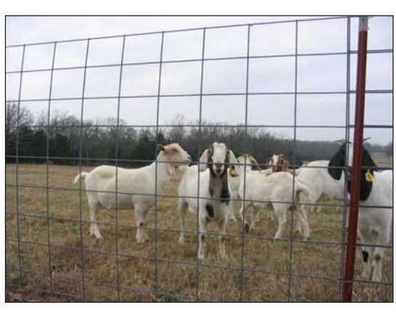
Although expensive, cattle panels make secure goat fencing.