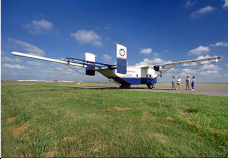
This twin engine plane (shown here at Harlingen) was used to gather airborne EM data