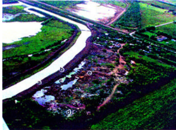
Aerial digital image of northwest corner of Donna Reservoir (150m altitude), documenting presence of solid waste landfill, where: (a) & (b) = soil leachate sample sites, (c) = filamentous algae on standing groundwater pools, (d) = construction and municipal wastes, and (e) = fill dirt & decaying vegetation.

undertaken at the unauthorized dump site in the northwest end of the reservoir. A second flight used aerial color digital oblique photographs to inventory this dump site, as well as other areas surrounding the reservoir. Sediment samples were collected along a leachate line of shallow groundwaters seeping into the reservoir from beneath the landfill.