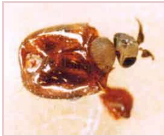
Figure 4. A young phorid fly emerges from the ant's head after pupating.