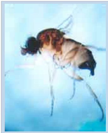
Figure 2. Phorid fly.

The small phorid flies are about 1/16 inch long and spend their time hovering above disturbed mounds or along foraging trails looking for fire ants. When a fly locates a fire ant, it swoops down and lays an egg on the ant. The egg will hatch into a tiny maggot that bores into the fire ant's head. The fly maggot grows inside the ant's head by eating the brain and other head contents. Once the ant dies the fly maggot pupates inside the head that has by now fallen off. Eventually, an adult fly emerges from the ant head and flies off to lay eggs on other fire ants.