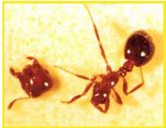
Figure 3. The phorid fly larva lives in the decapitated fire ant's head.