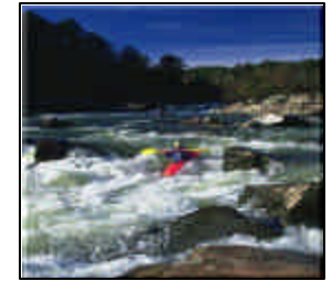
The Cossatot River

UNIVERSITY OF ARKANSAS COOPERATIVE EXTENSION SERVICE AGRICULTURE