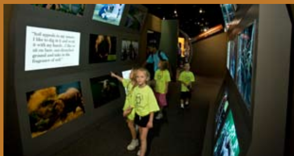
The Joy of Soil gallery celebrates our cultural relationships to soil with evocative photographs of people, animals, and landscapes.

Dig It! is captivating hundreds of thousands of Smithsonian visitors of all ages and has garnered rave media reviews. Call us today to discuss how Dig It! can help your museum reach new audiences.