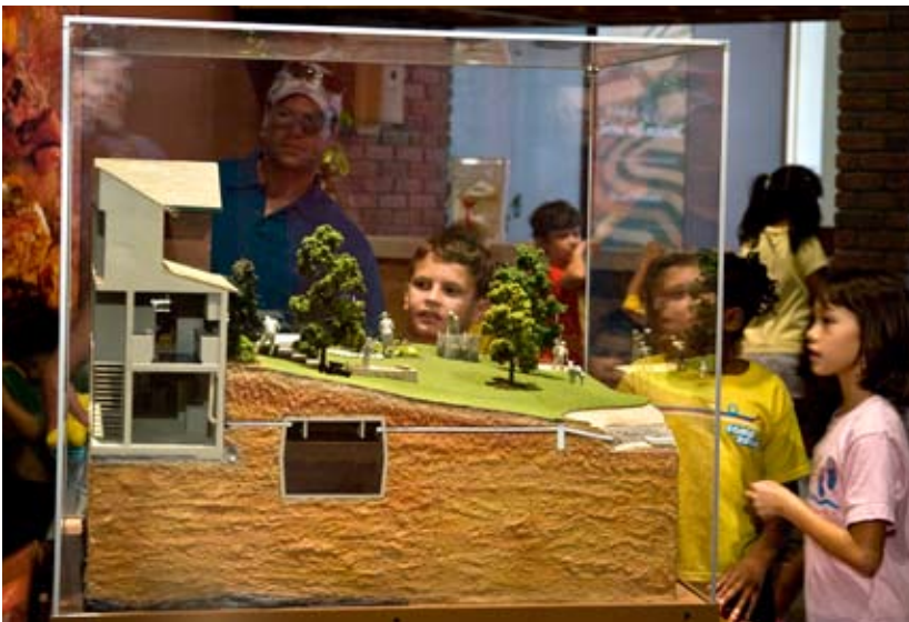
A scale model of a typical suburban house lot underscores connections between soil and culture.

SITES will provide two SITES technicians to work with venue staff during exhibition installation and de-installation (but not during exhibition receipt and ship out).