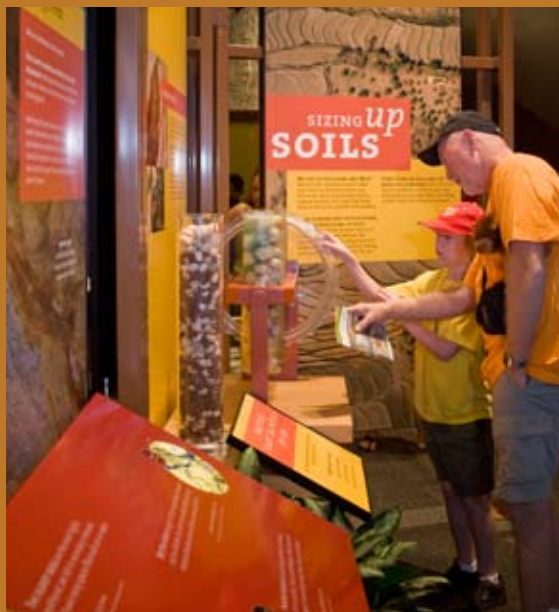
Visitors get the dirt on how water moves through soil in an array of fun interactives and exhibition stations.