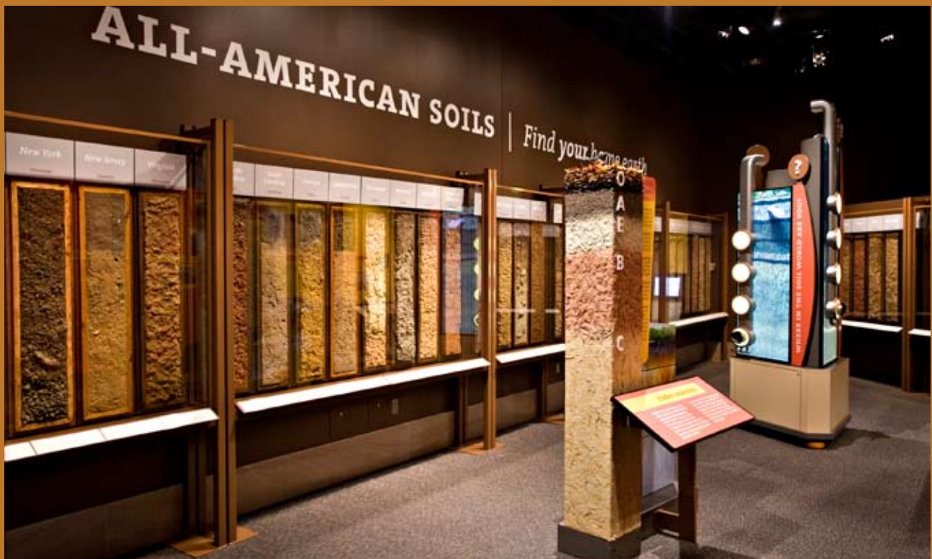
Visitors can find their “home earth” in All-American Soils, an awe-inspiring display of 54 soil samples, or monoliths, representing each state in the nation, the District of Columbia, the U.S. Virgin Islands, Guam, and Puerto Rico.

SITES has been sharing the wealth of Smithsonian collections and research programs with millions of people outside Washington, D.C., for more than 50 years. SITES connects Americans to their cultural heritage through a wide range of exhibitions about art, science, and history, which are shown wherever people live, work, and play. www.sites.si.edu