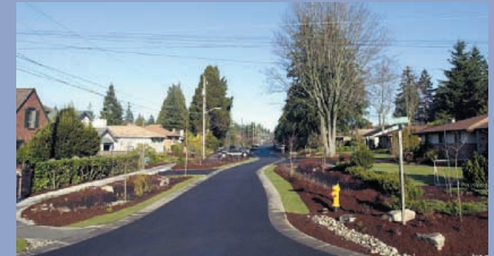
This residential street was redesigned by the City of Seattle under the Seattle's Street Edge Alternatives Program. Streets were narrowed and gutters removed so that runoff can be directed to swales and bioretention areas.