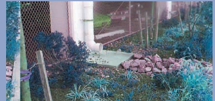
Drains from a parking garage or building can be directed to a vegetated area to reduce runoff and provide treatment.