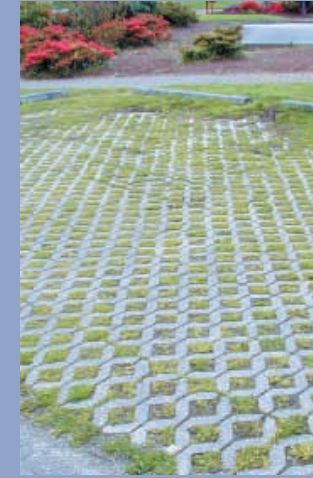
Permeable and porous pavements can reduce runoff, encourage infiltration, and filter pollutants.