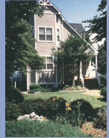
A rain garden (front) serves as a bioretention area for runoff.