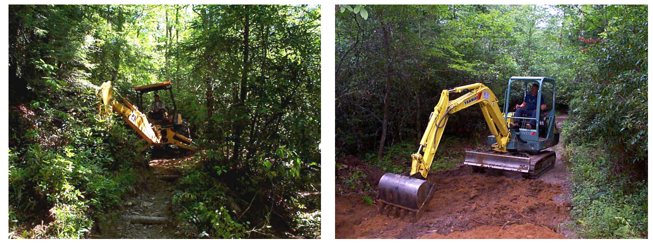
Figure 6. Backhoe working trail

using either a rubber tired tractor-mounted backhoe (Figure 6) or a mini-excavator (Figure 7). All the treated trails are open to horses trails, which means they are wider than foot trails. Hence the equipment, especially the mini-excavator, was narrow enough to negotiate the trails without creating additional damage. Field design allowed the placement and construction of the water bars and traps to be adjusted to the specific site conditions rather than be locked into fixed design.