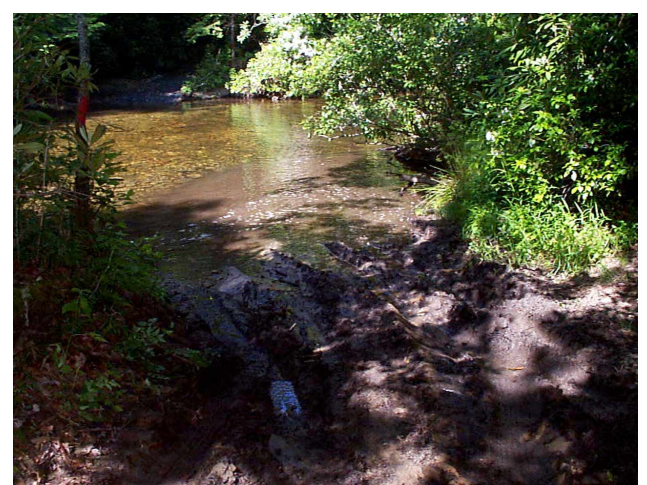
Figure 8. Muddy river crossing, Bradley Ck Trail

River crossing: Horseback riders heavily use the first main river crossing of the Bradley Creek trail. The approaches were always muddy and funneled trail runoff directly into the river (Figure 8). The approaches were hardened with oversized (3-inch diameter) clean stone so the horses would no longer erode the riverbanks or churn the bottom (Figure 9). Trail runoff entering the crossing was nearly eliminated by bracketing the approaches with new water bars and sediment traps. After more than a year of use, the crossing appears very stable and non-polluting. Three other main river crossings were stable, non-eroding and only required eliminating the trail runoff entering the river.