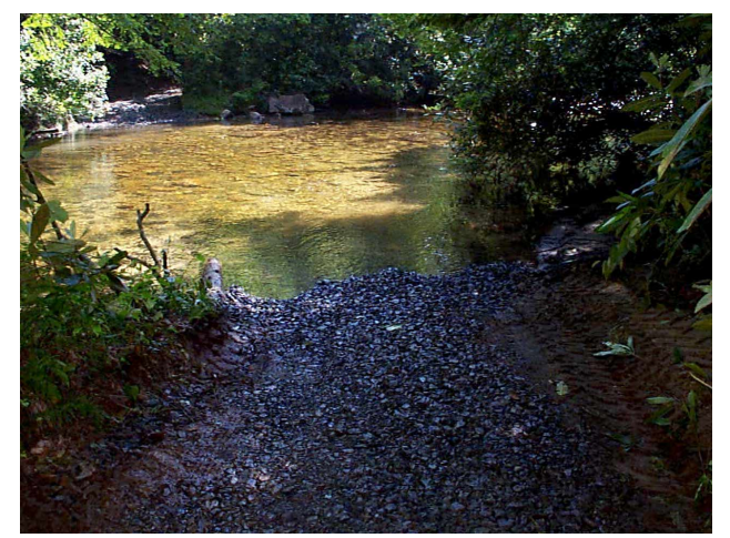
Figure 9. Stabilized river crossing

Wolf Ford Trailhead parking lot : The trailhead parking lot at the end of the Wolf Ford Road (old gaging station) was a major source of runoff and sediment to the river just as it entered its gorge. Several