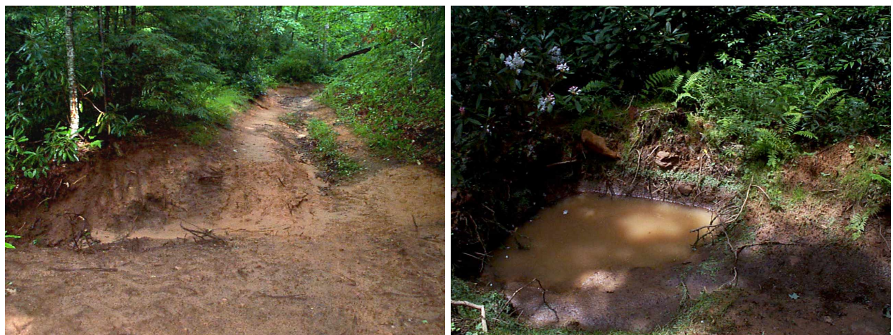
Figure 4. New water bar