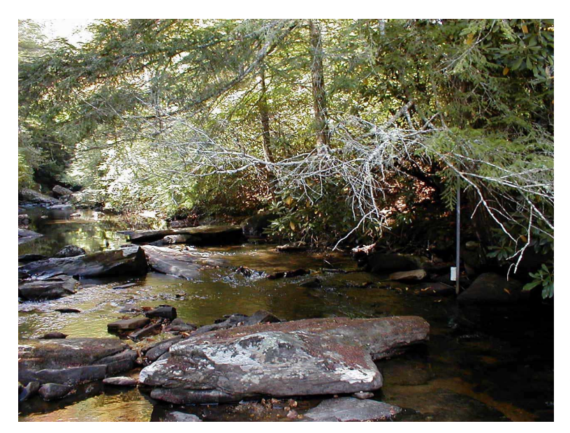
Figure 2. SFMR near Wolf Ford

The South Fork Mills River (SFMR) (Figure 2) and its smaller tributaries are classified State classified WS-II Tr ORW (Watersupply II - Trout -Outstanding Resources Waters) while Bradley Creek and its tributaries are classified WS-I Tr ORW (Watersupply I - Trout - Outstanding Resource Waters). The SFMR streams supply water to three existing municipal water intakes for the City of Hendersonville and a recently completed intake constructed by the Asheville-Buncombe Water Authority. These streams are potential or existing habitat for 33 different aquatic species listed as either Federal or State Threatened or Endangered, sensitive or of concern.