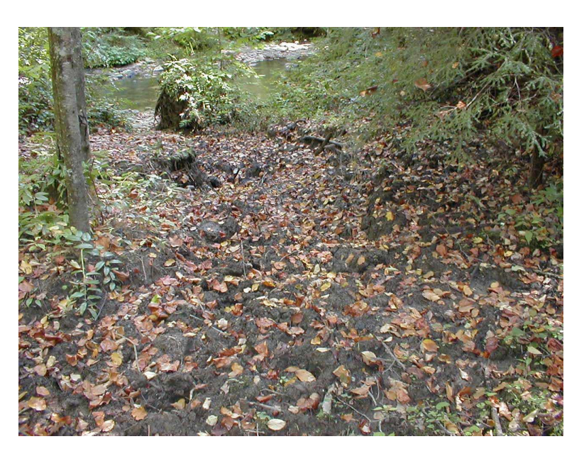
Figure 3. Runoff and sediment to the river

Recreational trail use is and has been extremely heavy. These trails are used for hiking, mountain biking and horse back riding. They also provide access for hunting and fishing. Most water bars that existed on the old roads were lost through erosion and lack of timely maintenance. Some trails have become chronic sources of sediment for the SFMR, especially those immediately adjacent stream channels. Prior to this project the Forest Service Hydrologist estimated that watershed-wide, as much as 50 percent of the trail surface drained directly to a stream channel, with some trail sections yielding as much as 90 percent of their runoff and sediment to a stream (Figure 3).