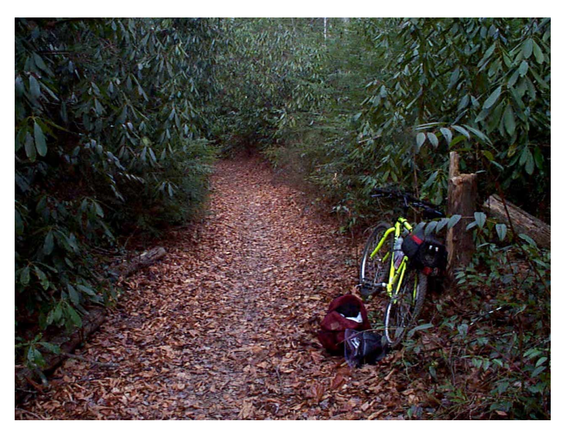
Figure 11. Treated trail with runoff controlled

Visual observations: Since monitoring changes in suspended sediment loading is difficult, visual observations of runoff and sediment deposits are invaluable. Sediment and leaf deposits were observed in many traps following rainstorms. This showed that material and runoff that previously reached the river was now being stopped. Long sections of trail, which pre-project were free of leaves due to flow on the trail, remained leafcovered throughout the wet seasons (Figure 11). This indicates there was no longer sufficient runoff on the trail to wash off the leaves. Based on these observations it is the opinion of the Forest Hydrologist that as much as 90 percent of the runoff that previously reached the river from the treated trails has been stopped.