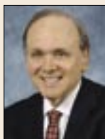
Daniel Yergin, Chairman Cambridge Energy Research Associates, Inc.