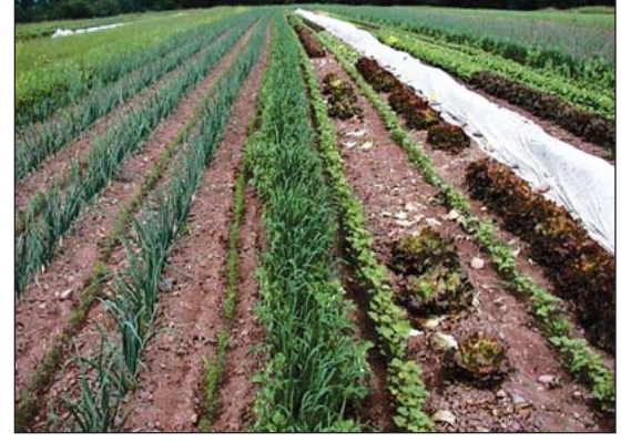
Interseeding artistry, from left: Vetch interseeded into onions, barrier strip of oats and buckwheat, buckwheat interseeded into lettuce, and winter squash row covered against cucumber beetles.

At any one time in the growing season, half the cropping area is in cash crops and the other half is fallow. A field of springplanted crops next has a year of fallow, then summer-planted crops. On the fallow sections, they use two cover crops and a bare fallow to control weeds. With this rotation sequence, they build their soil and eliminate weeds.