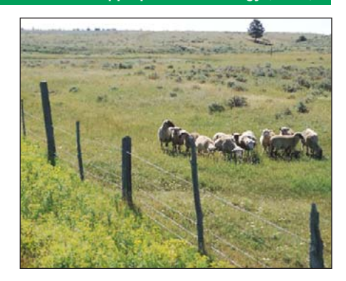
Sheep grazing to manage leafy spurge, a highly invasive plant, growing uncontrolled on the left side of this fenceline.

available: www.attra.ncat.org/calendar/ question.php/2006/05/08/p2221