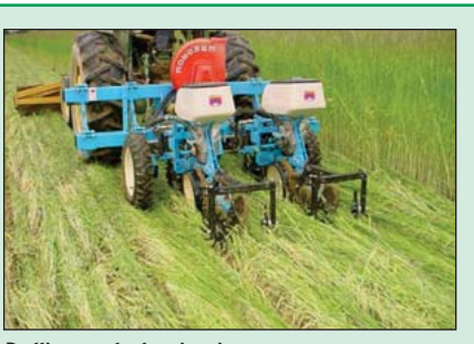
Rolling and planting in one pass saves energy, mechanical wear and tear, and conserves soil structure.

Until recently, organic no-till was problematic because of the difficulty of reliably killing the cover crops. Several field trials have demonstrated that mechanical roller-crimpers can kill a cover crop just as effectively as herbicides, opening the way for a higher degree of ecological weed, crop and soil management. An excellent review of no-till techniques and research by NCAT's Steve Diver is