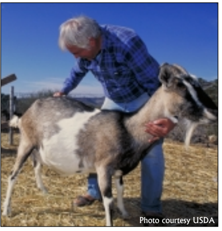
Visual appraisal is one way to evaluate an animal's health.