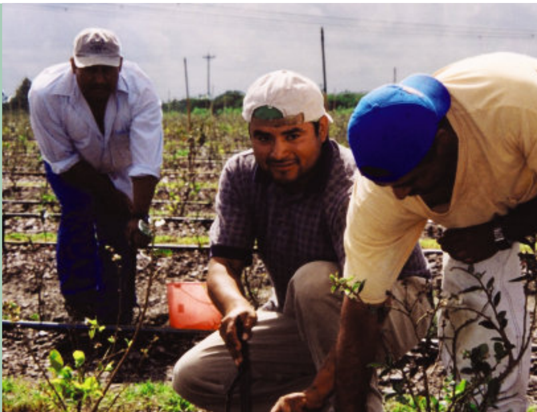
Left: Co-funded with the Southern Rural Development Center, Southern SARE's Sustainable Community Innovation grants link sustainable farm and non-farm economic development through innovative partnerships. For example, Harvest for Humanity, a private charity, is partnering with the Immokalee Chamber of Commerce and Collier County to improve quality of life for farm workers in south Florida. Here, farm workers plant blueberries that they may own someday through an employee purchase plan at Harvest Farm, the largest blueberry operation in South Florida. (Project CS02-008).