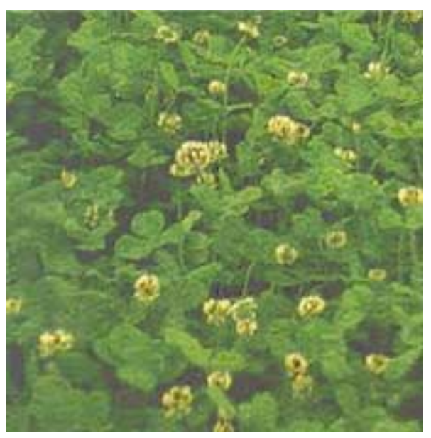
Illustration 3. Dutch white clover is an excellent addition to a mixed species lawn. (http://www.ampacseed.com/clover1.htm)

In more arid or degraded landscapes, black medic is a good complement to turfgrass or wildflowers in a natural lawn. It can also serve as a temporary restoration crop to aid in turf establishment. Like clover, medic fixes nitrogen, helps aerate the soil with its deep root system, grows close to the ground, and is non-invasive (24).