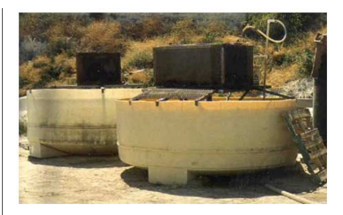
A compost tea brewing tank in California. Steve Diver

Compost tea. You can make anaerobic compost tea by soaking a burlap bag full of compost in a barrel of water for up to two weeks. Soaking for four to seven days at temperatures below 65° to 70° F provides the highest level of disease suppression (8). Aerobic compost is prepared in the same manner, except that the ratio of water to compost should be no more than 10 to 1, and the compost should be soaked in the water for no more than 48 hours. Another method for producing aerated compost is to add compost to a brewer or vat that has air bubbling through it. Both anaerobic and aerobic compost extracts protect against plant diseases (43). Research examining the effect of compost tea on golf greens found that treated grass had longer roots, fewer diseases, and higher density than untreated turf. For this study, compost tea was applied weekly to bi-weekly at the rate of one gallon per 1000 square feet (44). For more detailed information on the production and use of compost teas, see the ATTRA publication Notes on Compost Teas .