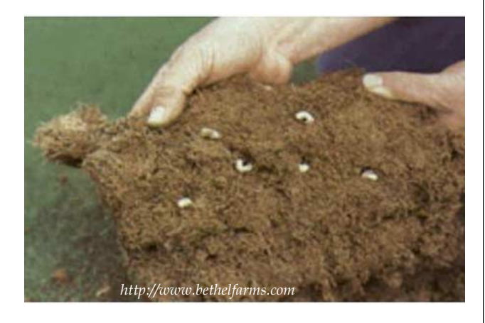
Grubs feeding on turf.

as well as pests. Pesticides also kill many soil organisms that decompose organic matter, form aggregates, and suppress diseases. As a result, pesticides may decrease insect infestations in the short term, but create other conditions that increase turf stress. Thus, turf managed with pesticides often has more pest problems and requires more intensive management than turf managed with biological products.