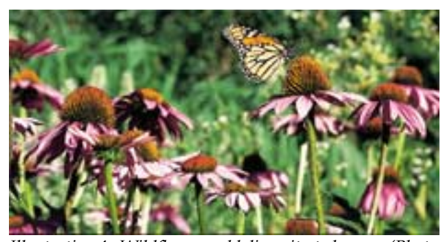
Illustration 4. Wildflowers add diversity to lawns.

Since many wildflower seeds are small, you have better control over their distribution if your mix them with compost, potting soil, or sand before broadcasting. Attempt to plant approximately fifteen to thirty seeds per square foot. This will ensure that there are enough plants to crowd out weeds without the wildflowers being so close together that they are not able to bloom (31, 33).