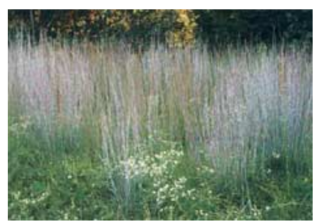
Illustration 5. Prairie grasses can add diversity and beauty to a natural lawn

Grasses, especially native warm-season prairie grasses, are a natural complement to wildflowers. The grass species little bluestem ( Andropogon scoparius ), sideoats grama ( Bouteloua curtipendula ), and indiangrass ( Sorghastrum nutans ) are excellent companions for wildflowers since they grow readily on almost any normal, well-drained soil, and can tolerate very dry conditions. In contrast, common lawn grasses — such as Kentucky bluegrass, tall fescue, and smooth bromegrass — grow too aggressively to serve as good companions to wildflowers (31).