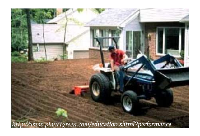
Tilling compost into soil during lawn renovation.

Compost application. Compost can be tilled into the soil during turf renovation, used as a topdressing, or sprayed on as compost tea. Solid compost can be applied as an unmixed material or mixed with sand for easier handling. The method of application depends on whether you want to improve soil quality, enhance soil fertility, or control pests and diseases.