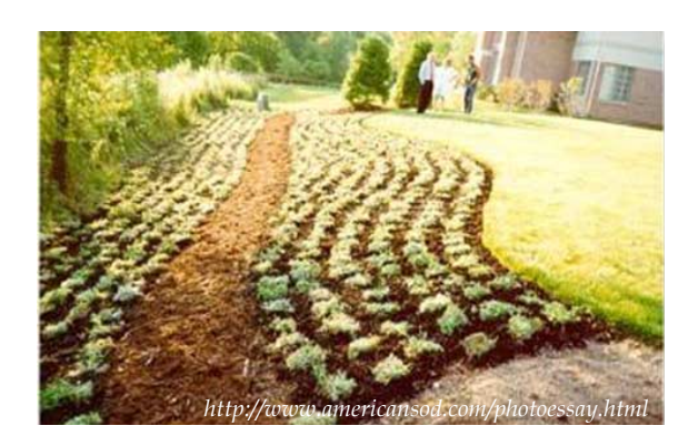
Recently laid wildflower turf.

Choosing and installing sod. Most sod contains high-maintenance grasses and is grown using synthetic inputs. If you use sod, try to choose one grown that uses compost and contains a mix-