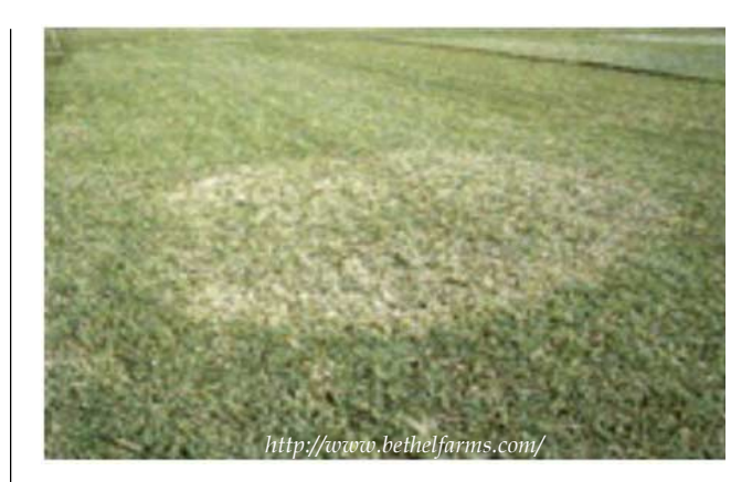
Brown patch disease can be controlled by the application of certain types of compost.

Characteristics of disease suppressive composts. The composition, age, and preparation methods of composts are keys to their providing disease suppressive benefits. Compost must be mature and fully cured to suppress diseases. Immature compost has a high concentration of ammonic nitrogen (NH<sub>4</sub>) and increases, rather than decreases, the incidence of Fusarium diseases (39). Disease