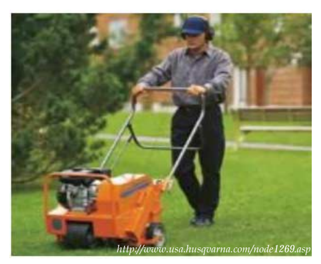
A professional aerator.

Following mechanical aeration, topdress compost onto the field or lawn. The topdressed compost will fall into the core holes, resulting in a partial incorporation of the compost into the soil. Mixing 40% compost with 60% sand produces a