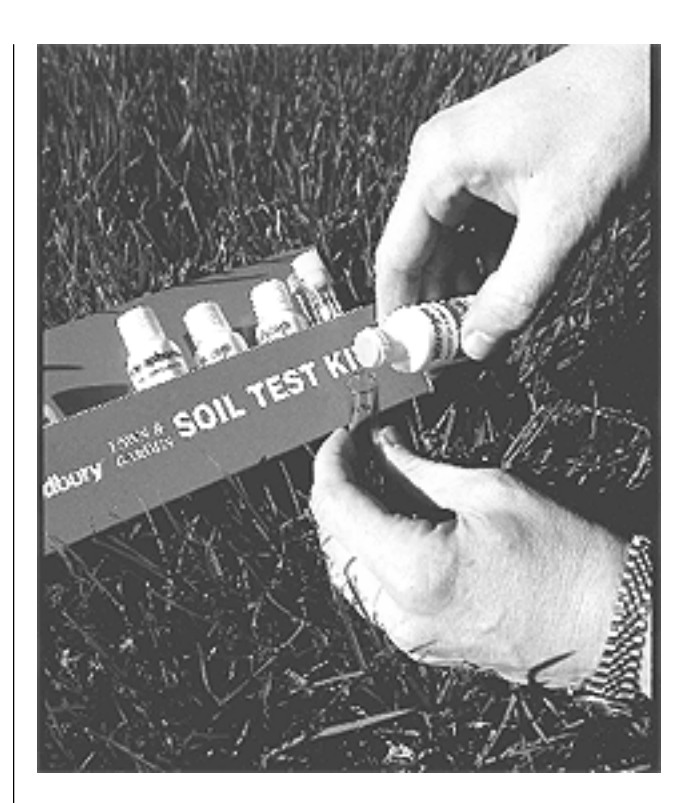
Illustration 2. Soil testing helps you provide your lawn with the correct amount of nutrients without risking contamination of the environment

Natural nutrients sources. While compost is an excellent natural nutrient source, its balance of nutrients may not be the same as those required for healthy turf growth. Consequently, you may occasionally need to apply more targeted nutrient supplements. Table 2 contains a list of nutrient supplements and their designation as organically approved, permitted, or prohibited. For additional information on soil amendments and organic fertilizers and where to obtain these products, see the ATTRA publications Alternative Soil Amendments and Sources of Organic Fertilizers and Amendments , respectively.