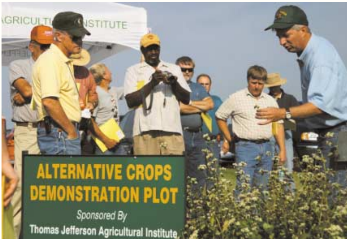
Participants at a field day hosted by the Thomas Jefferson Agricultural Institute in Columbia, Mo., learn more about buckwheat, one crop in a host of profitable diversification options. Public education programs increase networking among producers trying new enterprises.