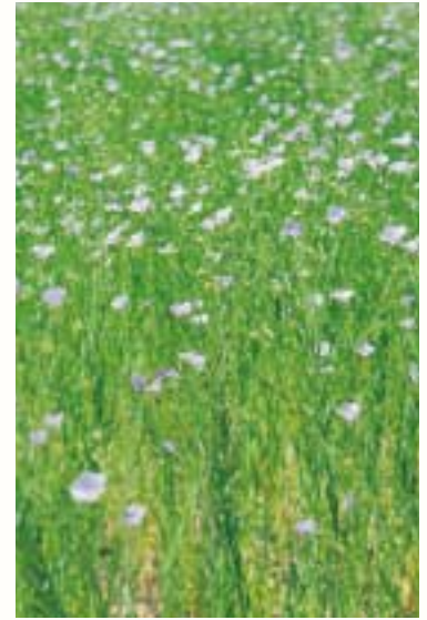
Alternative grains and oilseeds – like, from left, buckwheat, amaranth and flax – add diversity to cropping systems and open profitable niche markets while contributing to environmentally sound operations.

Published by the Sustainable Agriculture Network (SAN), the national outreach arm of the Sustainable Agriculture Research and Education (SARE) program, with funding by USDA's Cooperative State Research, Education and Extension Service.